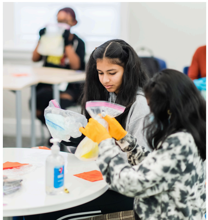
LEAD Girls of NC develops teen girls in Forsyth County into confident, active community leaders.

“This year we saw a 30% increase in girls feeling they can give an honest ‘no’ to things they don’t want to